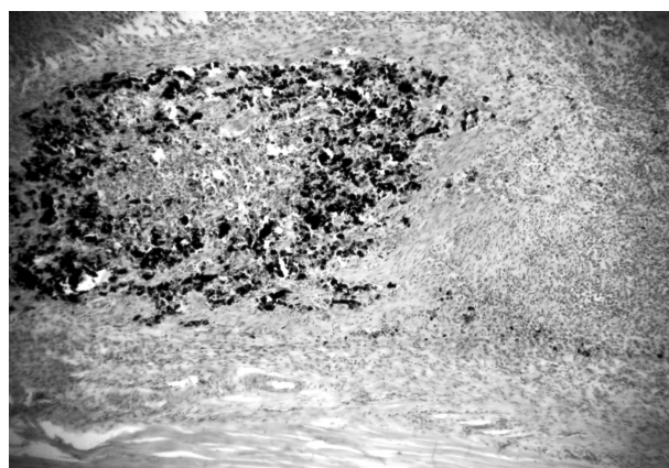
Fig. 1. Photomicrography of tissues around the abscess on day 12 of formation after 3-time irrigation with the combination of silver and gold nanoparticles. Hematoxylin-eosin, × 200

The edema of adjacent tissues was insignificant, in the microenvironment of the abscess macrophages and fibroblasts dominated among the cells; there were only